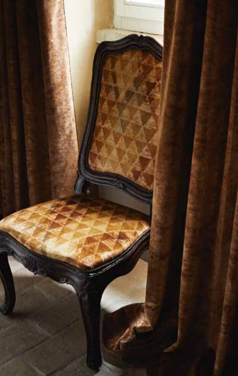
LEFT WALLPAPER ZAIS 311241 CURTAIN CURZON 331107 ARMCHAIR MICA MICO1017 PIPED IN LOTUS NEU16007 CUSHION ZAIS 321251 PIPED IN PERUZZI 330949 CHAIR ZAIS 321250 PIPED IN LOTUS NEU16007 ABOVE SOFA CURZON 331101 CUSHIONS FROM LEFT CURZON 331098 PIPED IN KETTI KET01005, CURZON 330782 PIPED IN KETTI KET01012, CURZON 331101 SELF PIPED THROW CURZON 331107 TRIMMED IN TASSEL AND BEAD FRINGE TMG05003 WALLPAPER ORESTE 311235 ABOVE RIGHT CHAIR ZAIS 321250 PIPED IN LOTUS NEU16007 CURTAINS CURZON 331107 PIPED IN KETTI KET01030