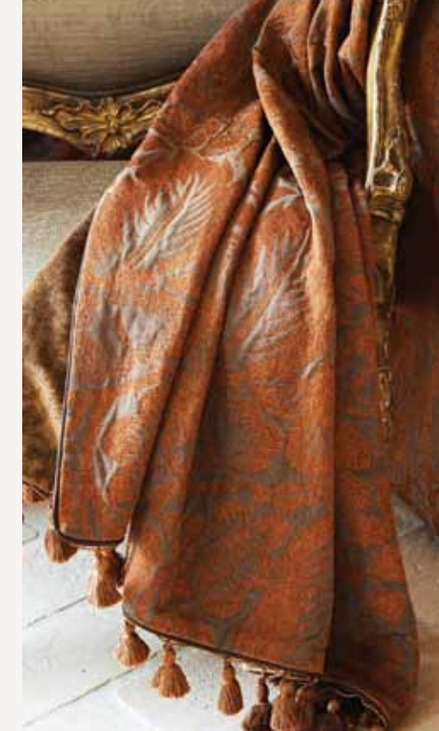
GRANADA is woven in viscose, cotton and linen as a 'lisere'; a quality which uses the first warp to create the ground colour and a second warp to create the motifs. In all, Granada uses three slightly different coloured threads to form the damask pattern that gives a faded, textural feel.