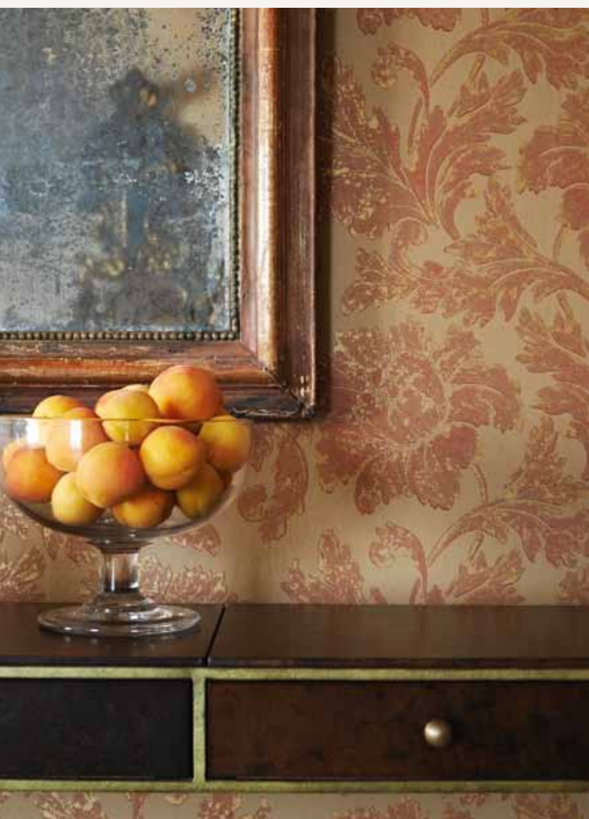
ABOVE WALLPAPER TADEMA 311234 RIGHT WALLPAPER THE GONDOLIER 311262 CHAIRS PERUZZI 330946 TRIMMED WITH %" FLANGED CORD TMG04004 CUSHIONS STITCH DAMASK 331213 BACKED IN CURZON 330785 AND PIPED IN KETTI KET01030 THROW GRANADA 331203 BACKED IN CURZON 330785, PIPED IN KETTI KET01030, TRIMMED IN TASSEL AND BEAD FRINGE TMG05003

THE GONDOLIER was designed by artist Melissa White, of Zoffany's 'Arden Collection' fame. Venetian Renaissance buildings, bridges and canals have been painted in a loose, mural style and then printed full width as a stunning panoramic wallpaper. Complementing this is the opulent digitally printed velvet of the same name.