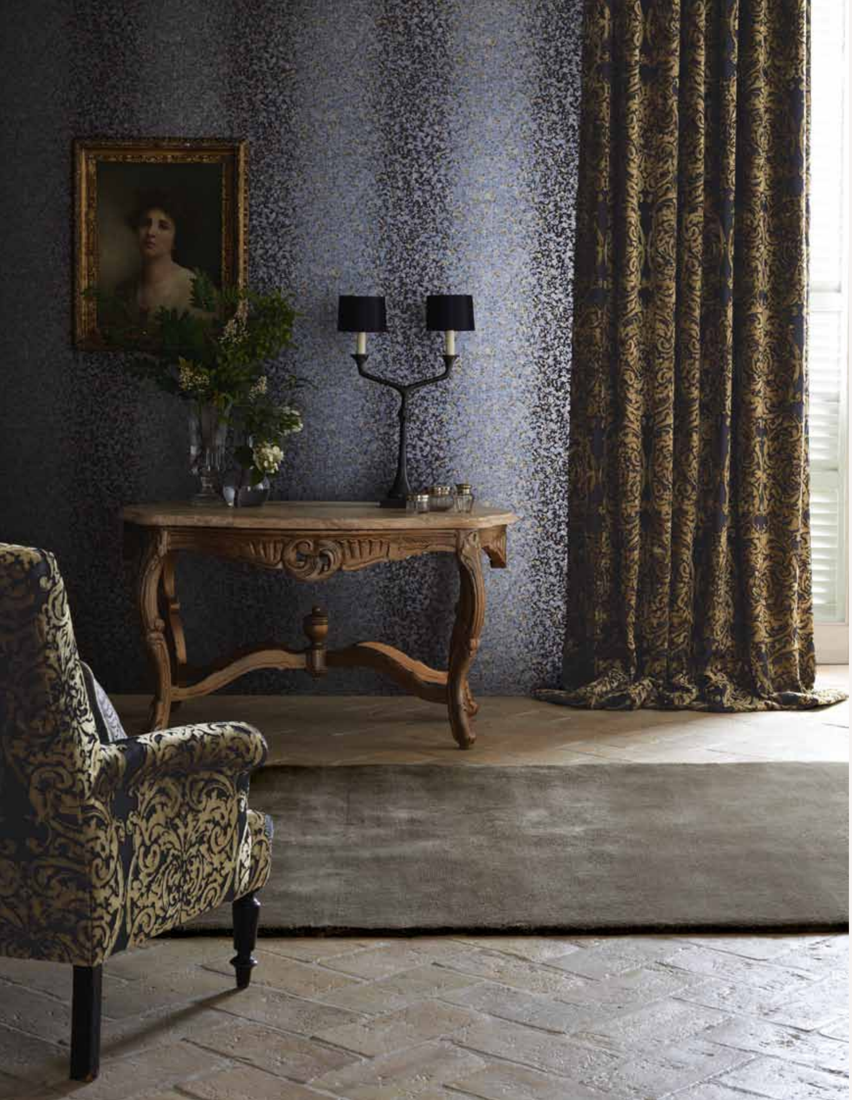
TESPI is an ornate, figured velvet woven with a viscose pile on a flat ground which is 'cross' dyed to create a rich two colour effect within the scrolling oval damask motifs, similar in style to those that Fortuny often used in his work.